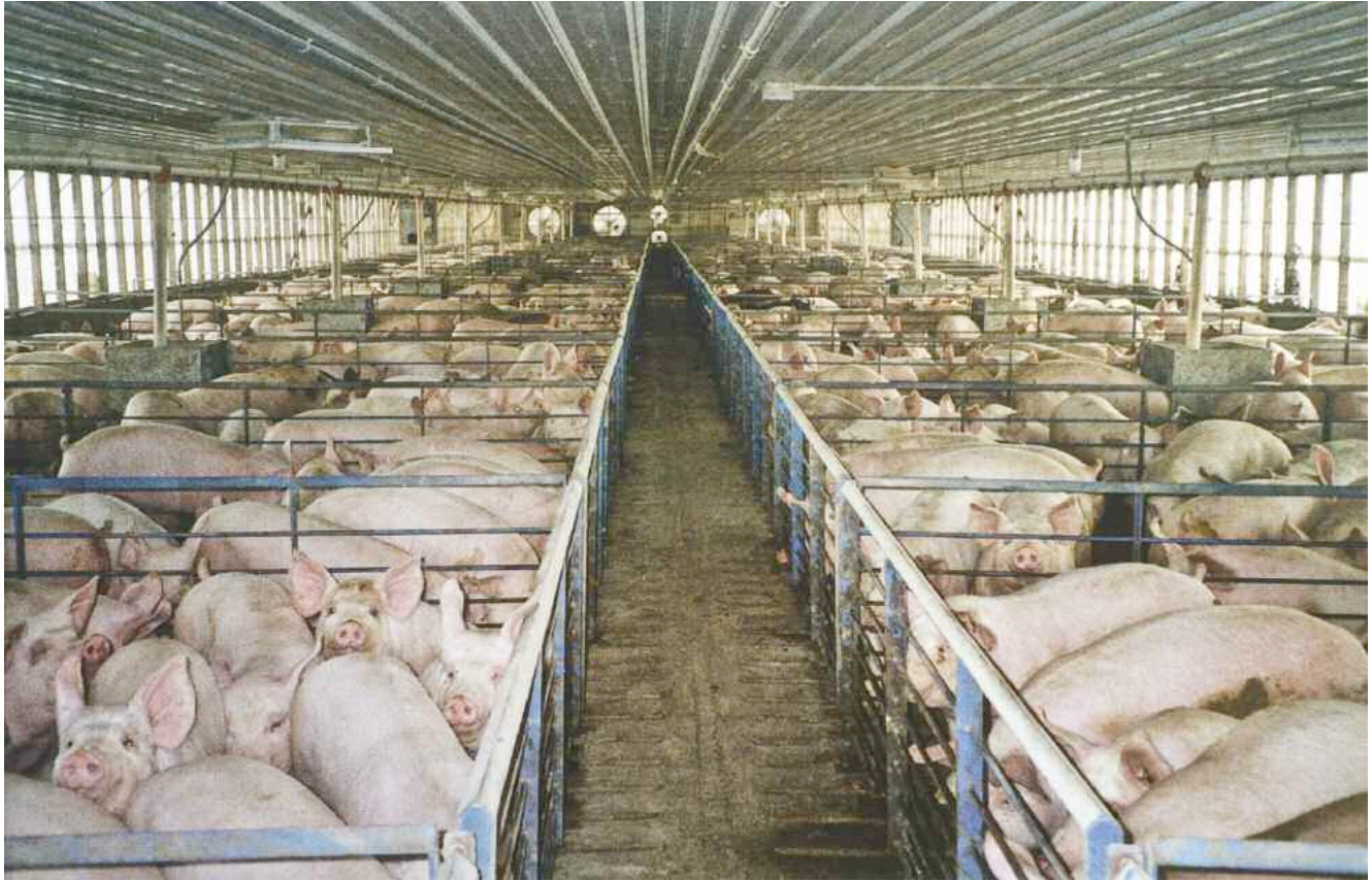
Scene on the factory floor: pigs in production.

more extensive than for alternatives to livestock products.